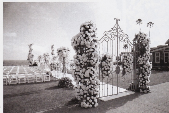
An elegant and commanding floral gate wreathed in heavenly white roses, hydrangea blossoms, and abundant green leaves set the tone for the ceremony. A snowy aisle lined with floral arrangements in varying heights stretched from the double doors of the gate to an altar of columns wrapped in garlands of flowers and topped with layers of ethereal fabric.