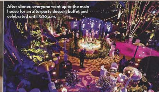
After dinner, everyone went up to the main house for an afterparty dessert buffet and celebrated until 3:30 a.m.