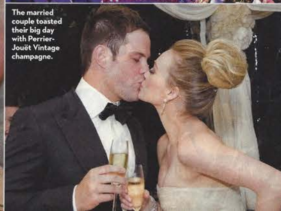
The married couple toasted their big day with Perrier-Jouët Vintage champagne.