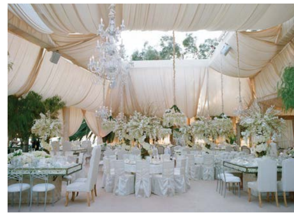
STARRY NIGHTS A custom tent was constructed with three large sky openings to view the beautiful stars that night.