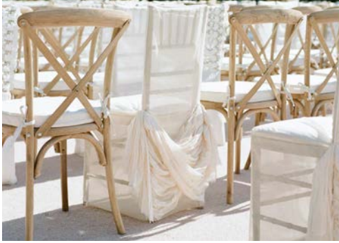
CHAIR CHIC The ethereal ceremony was lined with a mix of vineyard chairs and chiavari chairs -some which were slipped in a gorgeous array of sheer white covers from Revelry Event Design.