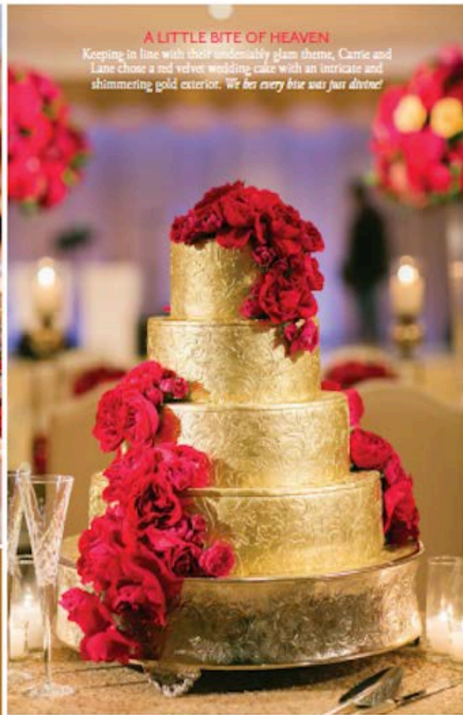
A LITTLE BITE OF HEAVEN Keeping in line with their undeniably glam theme, Carrie and Lane chose a red velvet wedding cake with an intricate and shimmering gold exterior. We bet every bite was just divine!