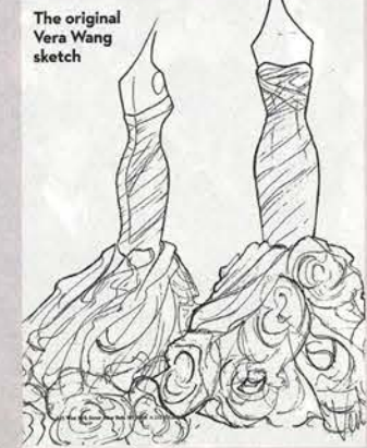
The original Vera Wang sketch