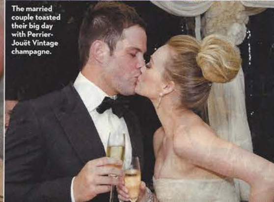
The married couple toasted their big day with Perrier-Jouët Vintage champagne.