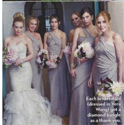
Each bridesmaid (dressed in Vera Wang) got a diamond bangle as a thank-you.

Lanterns hung over tables of dahlias, lilies and roses. The napkins were monogrammed by hand with the couples' new initials.