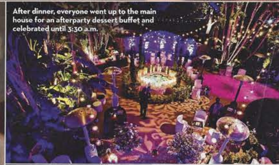
After dinner, everyone went up to the main house for an afterparty dessert buffet and celebrated until 3:30 a.m.